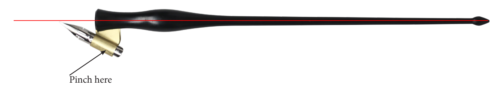
Figure 2: Standard size nibs should be inserted into the metal flange until they are about even with the center of the pen. Some penmen prefer having the nib placed about 2mm or 1/8 of an inch above the center of the pen.