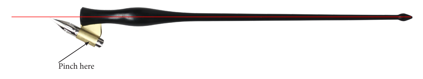
Figure 2: Standard size nibs should be inserted into the metal flange until they are about even with the center of the pen. Some penmen prefer having the nib placed about 2mm or 1/8 of an inch above the center of the pen.